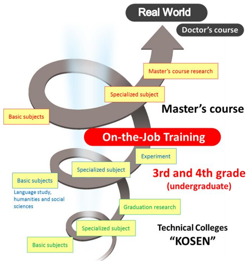
Diagram of TUT's unique spiral up education

After the completion of the master's degree program, students will be fostered as practical and creative engineering leaders for the real world.