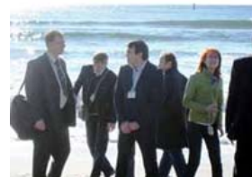
Excursion to a beach near the campus of Toyohashi Tech overlooking the Pacific Ocean