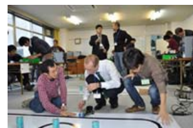
Guiding robots along race tracks during the robotics completion