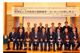
Group photograph of the EU delegates and Toyohashi Tech organizers of the symposium