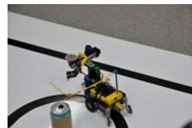
A robot moving along a curved path