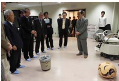
Shoichiro Toyoda visits the Center for Human-robot Symbiosis Research Center