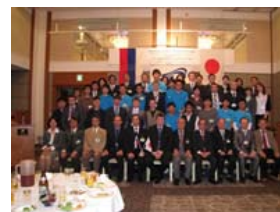
Reception for the Russian team on arrival in Toyohashi

Toyohashi Tech robotics club: http://www.tut.ac.jp/english/newsletter/club_activities/index.html