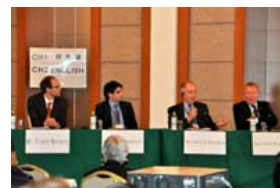
Members of the EU delegation