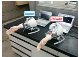
Fig. 2 The internet based handshake system connecting Japan and Taiwan.