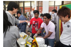
Sri Lankan students serving tea.

The participants voted and selected the Malaysian team (who served black tea with milk and sugar with a special pouring technique) for this year's best tea prize. The Bangladeshi and Indonesian teams were second and third, respectively.