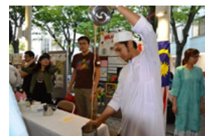
Tea performance by Malaysian students.