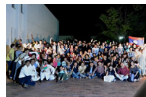
International students at the Tea Festival.