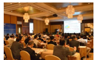
IGNITE 2013 Symposium