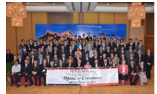
Participants at the IGNITE symposium