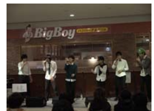
Team "Roku" held a concert at a department store