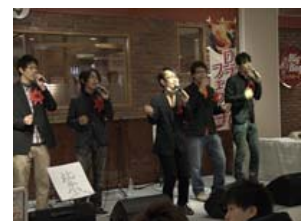
Team "Yukari" held a concert at a department store